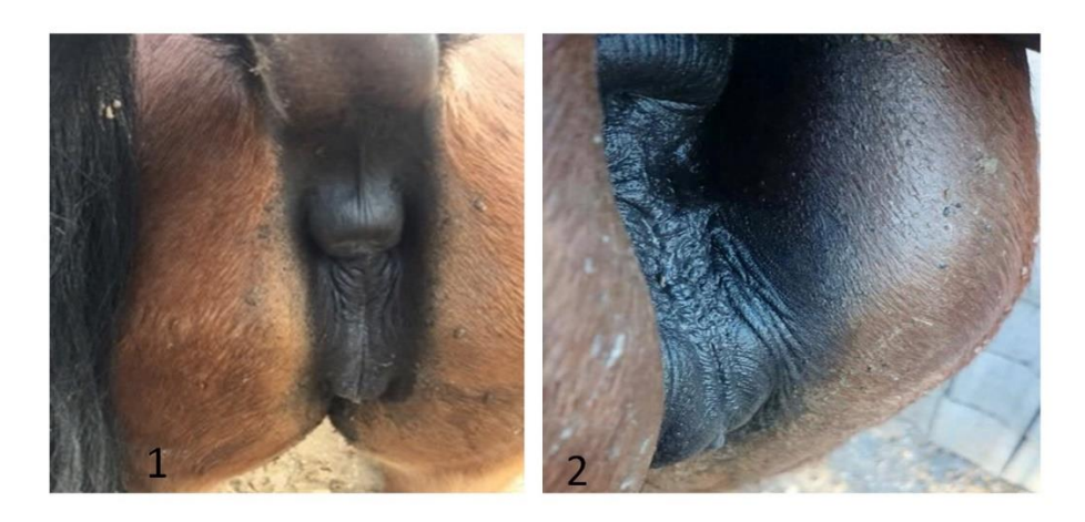
Figure.1 : Reveals grade I caslick's index with good vulvar conformation Figure. 2 : Reveals grade II caslick's index with moderate pneumovagina