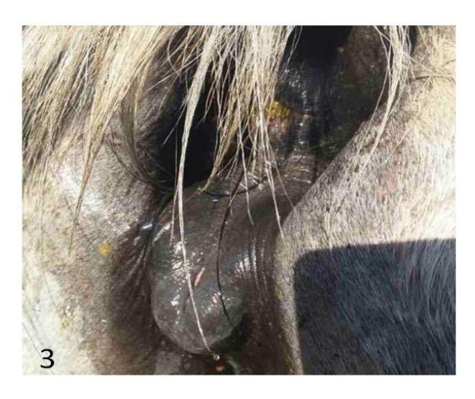
Figure. 3: Reveals grade III caslick's index with poor vulvar conformation